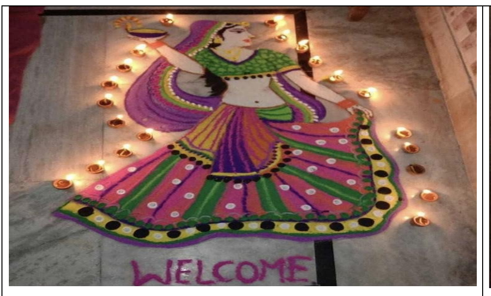
Shivam Tyagi - 3<sup>rd</sup> Semester (1<sup>st</sup> Winner)